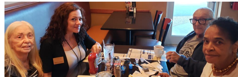
Keke’s Breakfast Outing. YUMMY!!!!