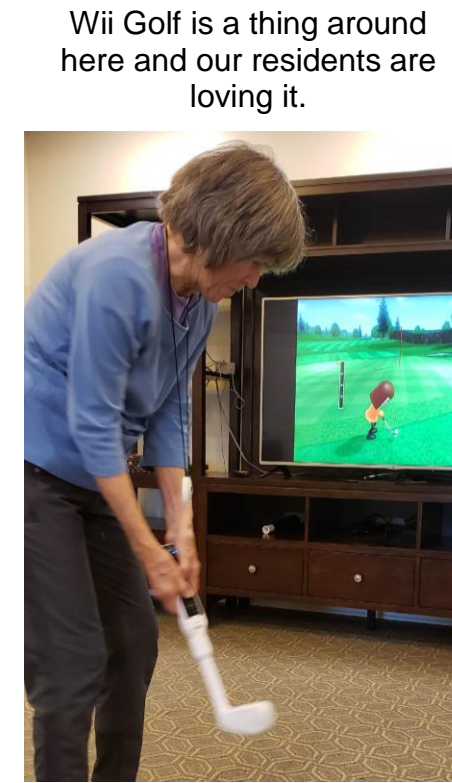
Wii Golf is a thing around here and our residents are loving it.