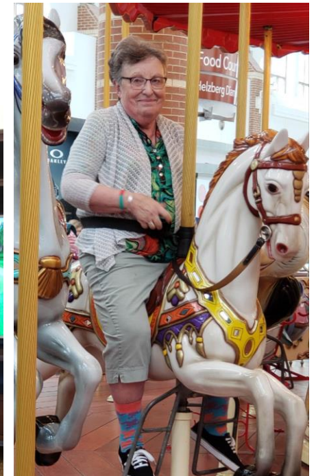
We all want to ride the Merry-Go-round, we just won’t admit to it