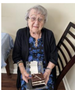
Celebrating a Milestone