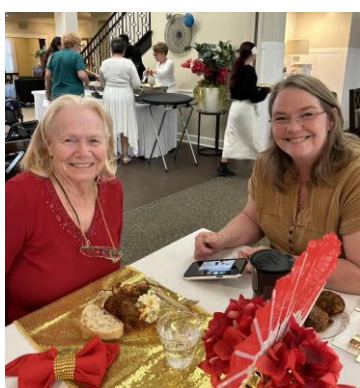
Friends & Family Party “Noche Blanca”