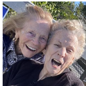
Outing to the Manatee Viewing Center