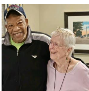
King & Queen of Sweetheart Dance