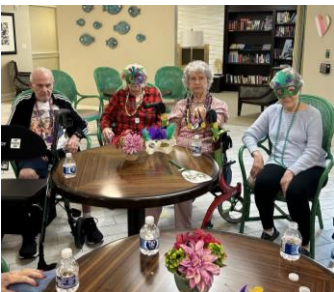
Mardi Gras Celebration